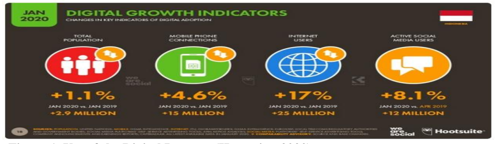
Figure 1. Use of the Digital Internet (Hootsuite, 2020)

The rapid development of technology, especially in connection with the use of the internet, has had a tremendous impact on people's lives, including transportation. Everyone needs transportation to access certain places, therefore several developments in internet technology have emerged in online transportation, such as online motorcycle taxis.